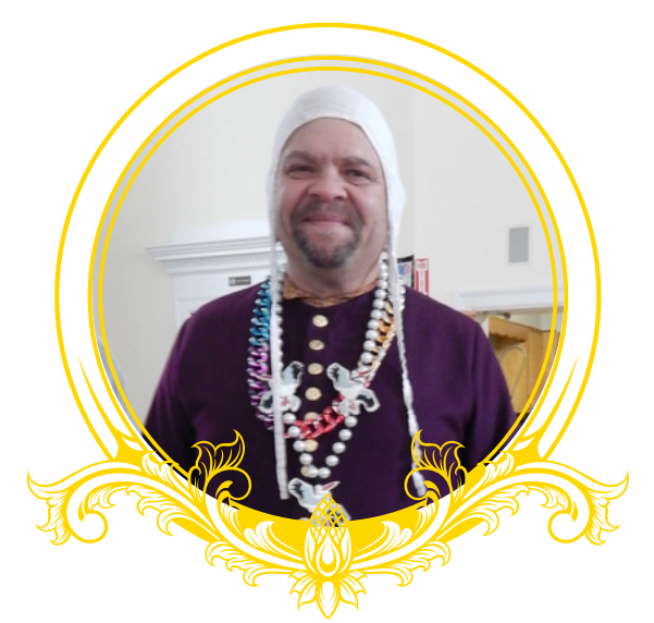
Vey, Seneschal Endewearde